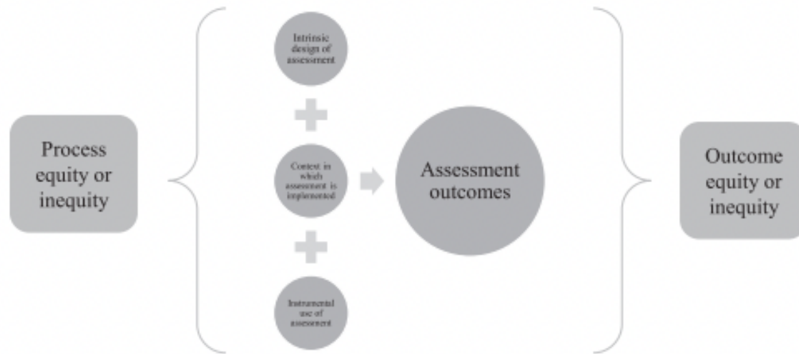
Figure 1 Components of Equity in Assessment

From: Lucey C, Hauer KE, Boatright D, Fernandez A. Medical Education's Wicked Problem: Achieving Equity in Assessment for Medical Learners. Acad Med. 2020 Dec;95. S98-S108.